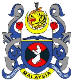
OBSTETRICAL & GYNAECOLOGICAL SOCIETY OF MALAYSIA